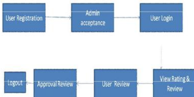
Fig.3. Rating based evidence.

Besides ratings, most of the App stores also allow users to write some textual comments as App reviews. Such reviews can reflect the personal perceptions and usage experiences of existing users for particular mobile Apps. Indeed, review manipulation is one of the most important perspectives of App ranking fraud as shown in Fig.3. Specifically, before downloading or purchasing a new mobile App, users often firstly read its historical reviews to ease their decision making, and a mobile App contains more positive reviews may attract more users to download. Therefore, imposters often post fake reviews in the leading sessions of a specific App in order to inflate the App downloads, and thus propel the App's ranking position in the leader board. Although some previous works on review spam detection have been reported in recent years, the problem of detecting the local anomaly of reviews in the leading sessions and capturing them as evidences for ranking fraud detection are still under-explored.